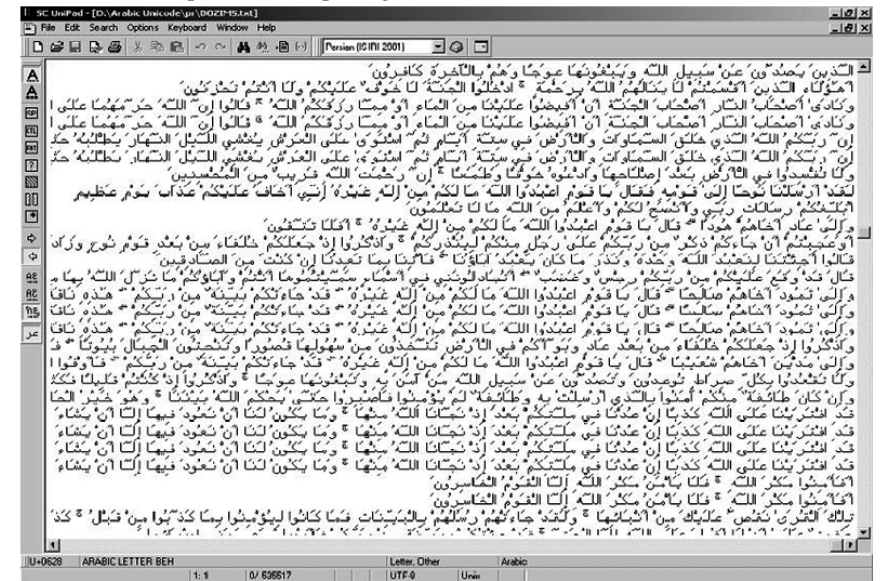
Figure 4. Output file 2: Depicting verses contain the occurred words

In our case it contains 2812 verse (it holds single verse twice and thrice because of a single verse could contain "Allah "twice" and "thrice"). Figure 4 shows the output contains in file 2.